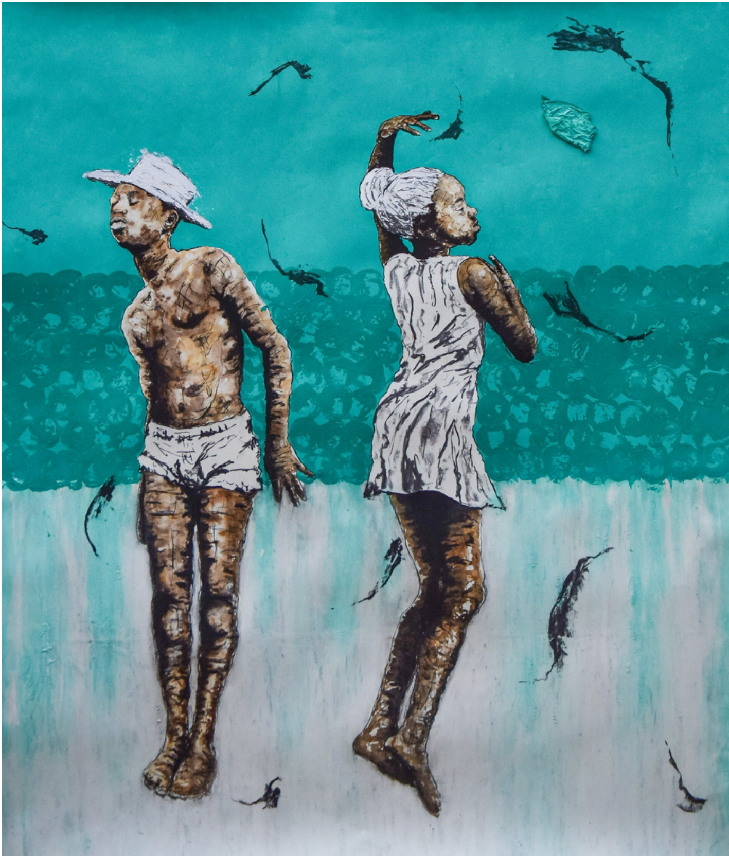
Simunye (we are one) 2022 Mixed media on Fabriano Signed by artist 160cm x 139cm